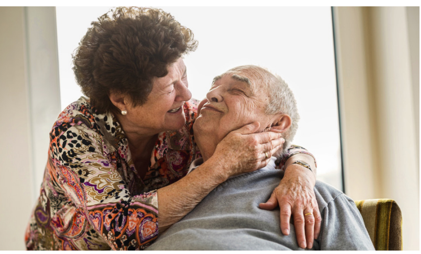
Aetna Better Health® of New Jersey